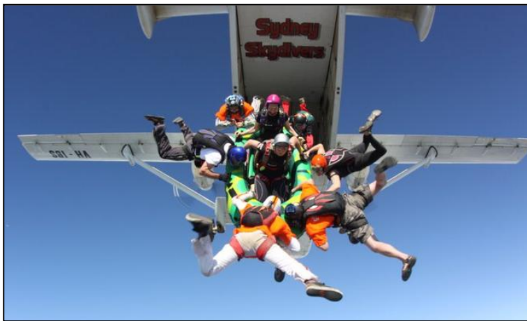
Raft jump out of the box

The action was hot both in the air and on the ground with huge bonfires running, calypso bar open and top entertainment playing nightly!